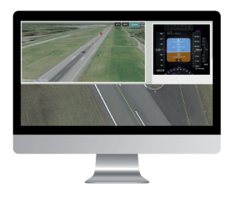
FLIGHT DATA CONNECT Web and Full-Service FDM/ FOQA Services